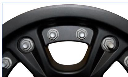
Matte Black 017