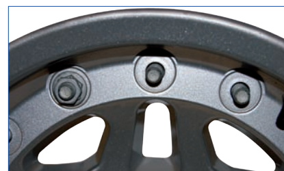
Sparkle Silver 047

All wheels are available in matte black, argent graphite or sparkle silver.