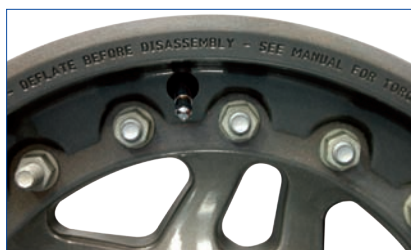
Argent Graphite 023