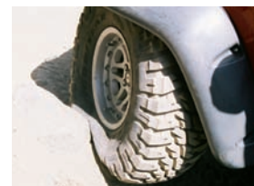
With BeadLock Full mobility at low pressure