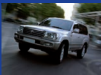
LC 100 - 105